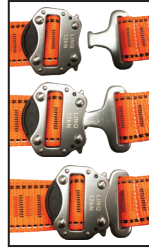
QUICK RELEASE BUCKLES