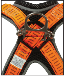
DORSAL BARR D RING